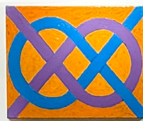
Michal Shapiro Knot Gold Acrylic on canvas 2018 | 16"H x 20"W