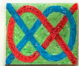
Michal Shapiro What's Knot to Like Acrylic on canvas 2018 | 22"H x 24"W