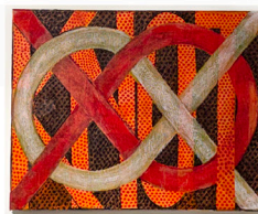
Michal Shapiro Obviously Knot Mixed media 2019 | 16"H x 20"W