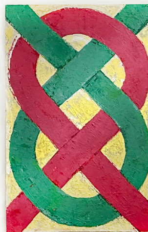
Michal Shapiro First Knot Acrylic on canvas 2015 | 46.5"H x 31"W