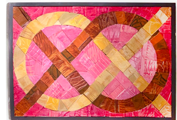
Michal Shapiro Pinker Pinky Knot Mixed media 2018 | 28.5"H x 20.5"W framed