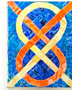
Michal Shapiro Blue Knot Mixed media 2019 28"H x 22"W