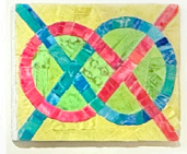
Michal Shapiro Bright Knot Mixed media 2022 | 24"H x 20"W