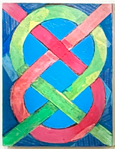
Michal Shapiro Knot Ever Mixed media 2018 | 28"H x 22"W