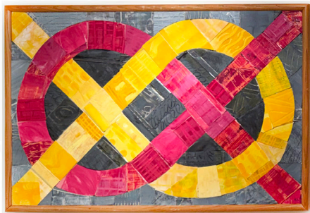
Michal Shapiro Mosaic Knot II Mixed media 2015 | 14"H x 36"W framed